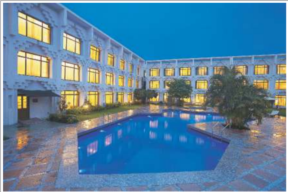
Pool Side View