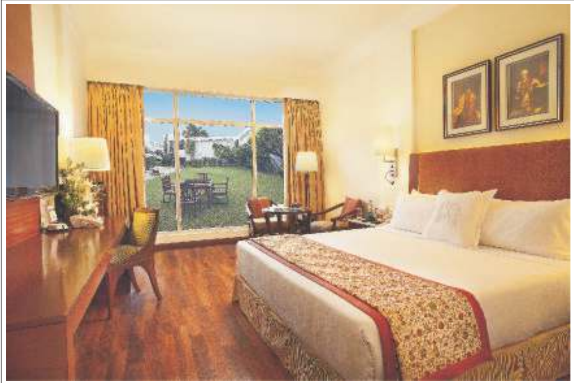
Executive Club Exclusive room