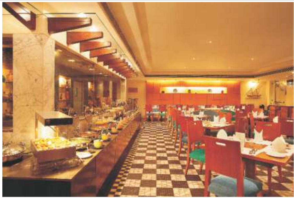
Cambay Pavilion - 24x7 Fine Dining restaurant