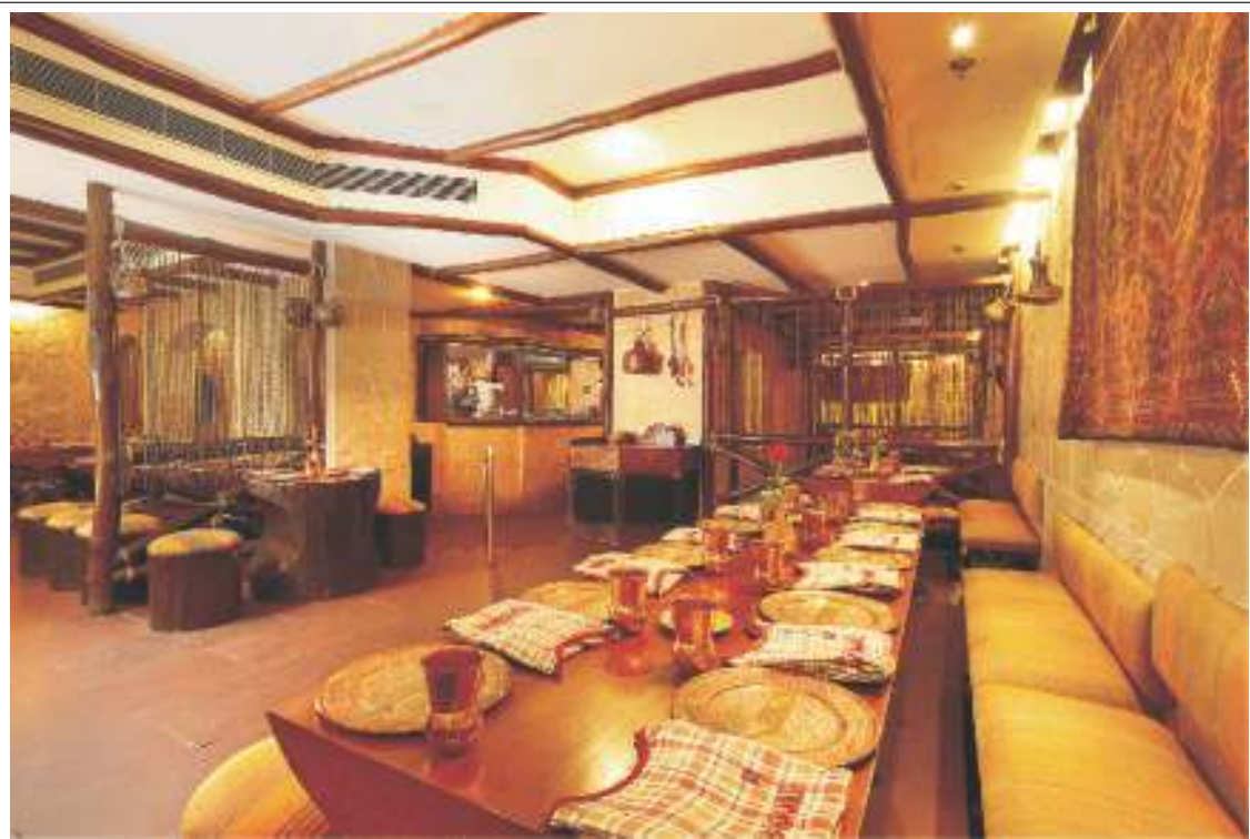
Peshawri - Speciality restaurant catering to North-West Frontier cuisine